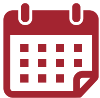
Annual or Multi-Year