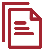
Details upon Request